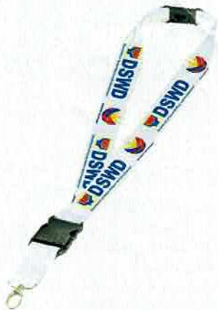
Official MC No. 1, S-2024