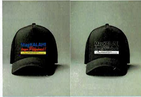
Bayani Ka! Awards Trucker mesh cap - Black Unisex - freesize Vinyl print of text (rubberized material)