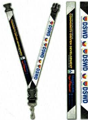
Mainstreamed with program advocacy