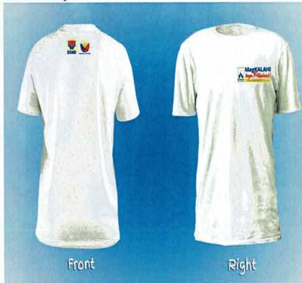
Mainstreamed with program advocacy