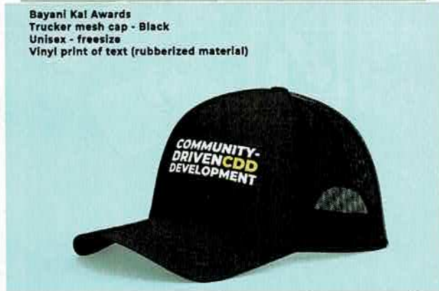
Additional layout advocacy for external