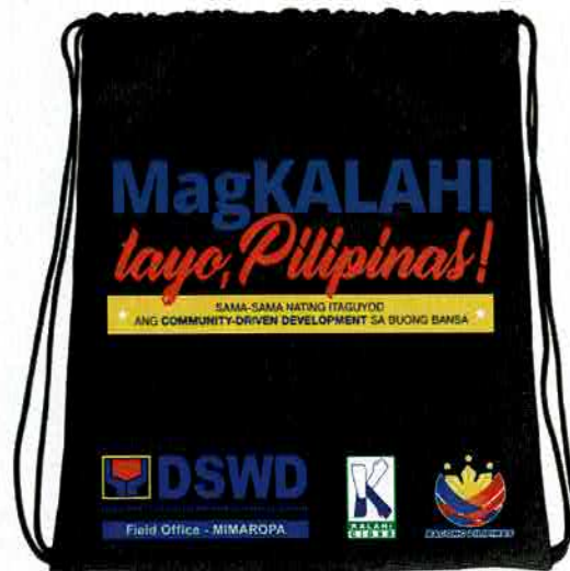
Mainstreamed with program advocacy