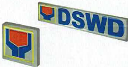
Mockup / Layout Official MC No. 1, S-2024