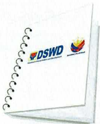
Official MC No. 1, S-2024