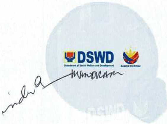
Front Layout Official MC No. 1, S-2024