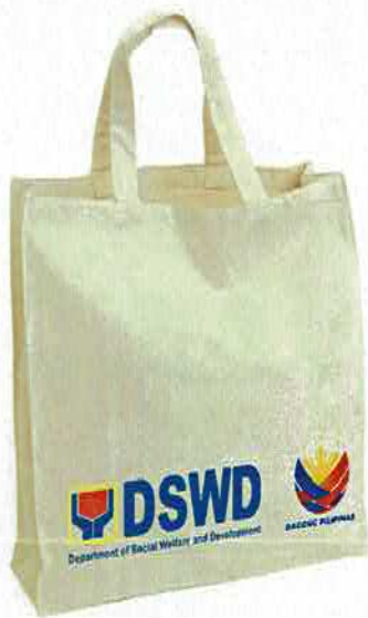
Official MC No. 1, S-2024