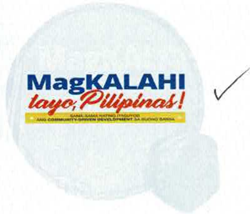
Rear Layout Mainstreamed with program advocacy