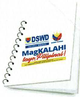
Mainstreamed with program advocacy