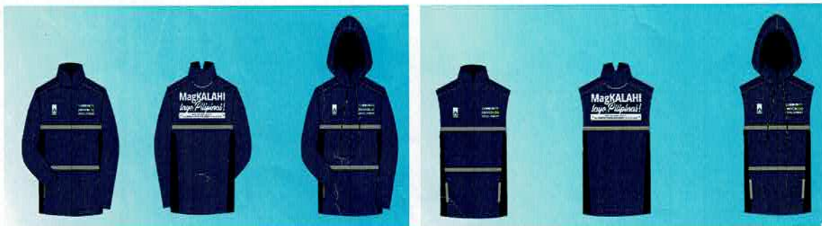
Mainstreamed with program advocacy, colored blue for external partner