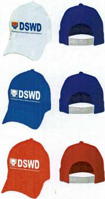
Official MC No. 1, S-2024