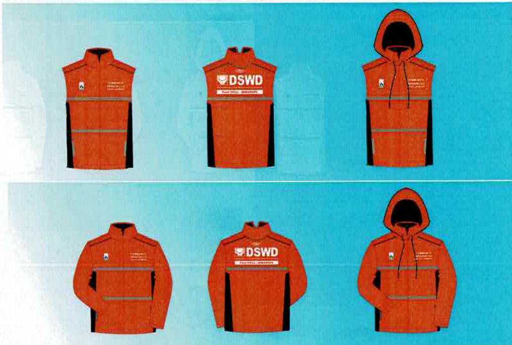
customized jacket convertible to vest