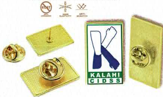
Additional Layout advocacy KALAHI-CIDSS Official Logo