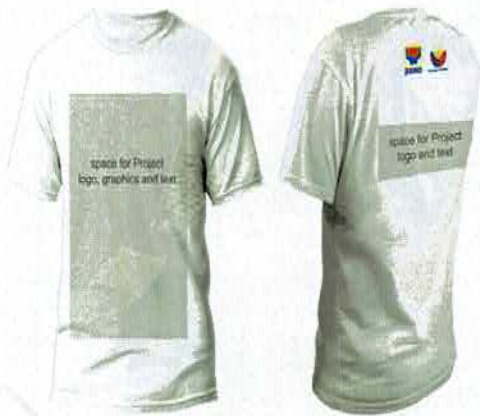
b. Project or partner-funded White Shirt Colored Logos - Applicable to different light colors